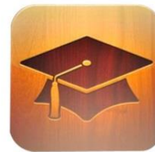
iTunes U app